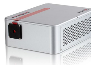
FemtoFiber ultra 920 – powerful and compact 920 nm femtosecond laser system with turnkey operation and cost-effective design for multiphoton and second harmonic generation (SHG) microscopy.

The FemtoFiber ultra 920 is a great solution for applications in non-linear microscopy that are based on two-photon excitation of fluorescent proteins or rely on SHG-based contrast mechanisms. With an emission wavelength of 920nm, the laser is perfectly tuned to efficiently excite green and yellow fluorescent proteins (GFP, YFP), which are commonly used e.g. in neurosciences and other biophotonic applications. With that, this fiber laser perfectly closes the wavelength gap in between the already existing FemtoFiber ultra systems at 780 and 1050 nm.